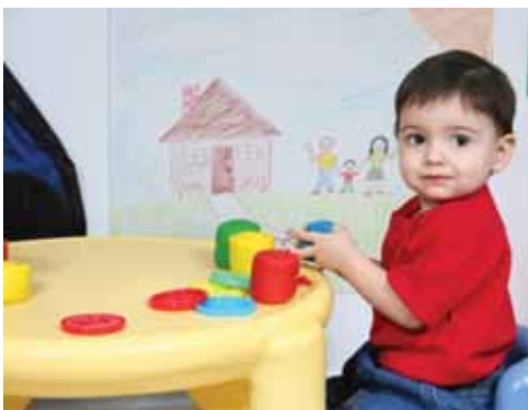
The importance of the under-threes

This consultation process has made us very keenly aware of the marked prevalence of psychosocial problems in the UK today throughout all income groups, although they increase significantly with disadvantage. If the psychological and social needs of adults are not met, this can have very serious implications for their ability to form durable, mutually supportive relationships and to provide their children with love, attention and boundaries. Psychosocial problems which often stem from an adult's own infancy, influence and cause relationship difficulties which can, in turn, exacerbate them.