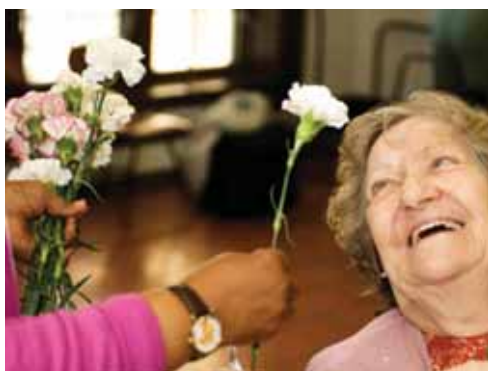
Carers should be adequately recognised for the work they do.

The rationale for raising the UK’s low level of Carers Allowance rests on the fact that this allowance, in reality, recompenses a very high level of work . The Economic Dependency paper (4.2.1: Fair Level of Support for those that truly cannot work) describes the importance of active benefits and an underlying expectation in the system that there should be ‘something for something’. This benefit already meets such a criterion. In addition, the carer is potentially saving the state the large amount of money which outsourced care would cost and that should be taken into account. 58 The UK lags behind other nations in supporting informal care. For example Ireland last year greatly increased its Carer’s Allowance to £135 for one person being cared for and £200 for 2 people.