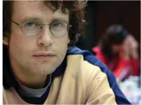
The couple relationship is at the heart of the issue of fractured families

Policy recommendations to address all of the above, and other related issues, will be outlined after brief treatment is given to the cause of family breakdown and the current policy context.