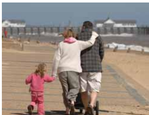
Supporting families so they can thrive

We have tried to take a step back and determine how the tide of family breakdown (dysfunction, dissolution and dad-lessness) might be turned in our generation – because this is not the work of one government, however long its term in office. This baton must be passed onto successive governments of different colours and thus have appeal and resonance across the usual political divides. The Family Breakdown Working Group was largely composed of academics and practitioners who were independent of any political party. Throughout the consultation process we tenaciously clung to the remit we were given from the outset that this was not to be a body of Conservative policies but a manifesto for stronger families throughout Britain. (Indeed we were repeatedly encouraged to develop just that by the Chairman, Iain Duncan Smith.) As such, and because we are convinced that all politicians have got the best interests of the nation's families at heart it is our belief that a new consensus can be build around the family which will gradually replace the contested discourse to which we have all grown accustomed.