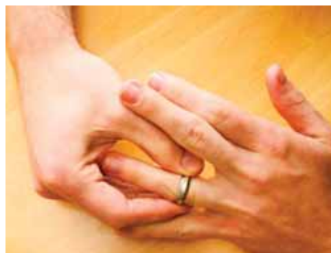
Separation is a reality of our times.

However, in so doing, we have been very concerned to avoid current policy's tendency to ignore the dictum that 'a sound polity has to be built around respect for the autonomy and privacy of the private realm' (Dench 2003). In order to build stronger families, which will be less prone to dissolution, dysfunction and dad-lessness, in many ways we need to give responsibility back to the families rather than impose 'good practice' from the centre. We also want to acknowledge from the outset that many families and parents do a good job, and that our proposals aim to build on their work, not to supplant it. We are certainly not recommending greater state intervention in the family, and would argue the need to 'roll back' that frontier.