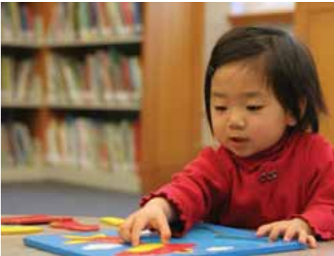
Child nursery centres

Previous findings from this study had already shown that quality, quantity and type of childcare all have different effects on children. Quality boosts academic performance but does not affect behaviour. Quantity, and increases in quantity, boosts problem behaviour but does not affect academic performance. Amongst types, group childcare in particular boosts