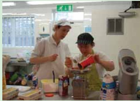
Stepping Stones Disability project in Birmingham

The project is run out of a small community centre and provides wholesome, affordable food for local residents, including many pensioners. This project therefore provides a service and social interaction for the elderly, building the community as well as training those with disabilities, giving them a ‘stepping stone’ to the wider workplace. The project builds self esteem in its staff and gives them a sense of purpose