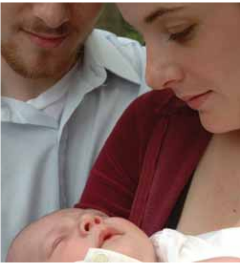
Protecting families during times of vulnerability