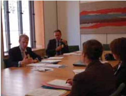
The Family Breakdown Working Group invited many organisations to give evidence for the Fractured Families report.

The number of divorces in the UK doubled between 1960 and 1969 and doubled again between 1969 and 1972, following the 1969 Divorce Reform Act. In 2005 the figure stood at 141,750 for England & Wales. 9 Current estimates suggest that 28% of all children will experience parental divorce by the time they are aged 16. As Fractured Families made clear however, of even greater concern is the markedly more unstable nature of cohabitation and the growing tendency for parents not to live together at all. The Millenium Cohort Study indicates