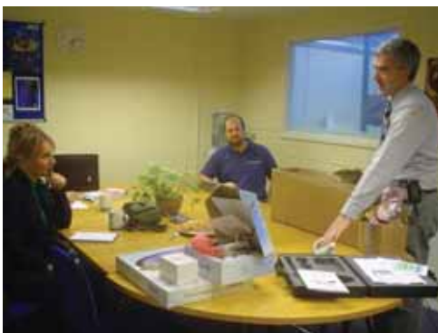
Family group visiting the Josian Centre, Southampton.

A hub equivalent to the Josian center in Southampton in every parliamentary constituency would cost £65m in annual rent. However although centralised hubs bring increased costs for new services, they also bring considerable efficiency gains to both provider and user by putting many services under one roof.