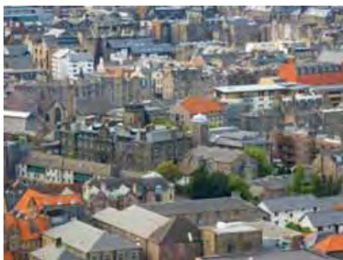
British housing stock is stretched and building land is at a premium

Local authorities can also facilitate access to people at key life stages through primary care trusts, primary and secondary schools, and social services. As stated in Chapter 1, the implications of this greater load on local authorities should be thoroughly thought through by an Implementation Working Party which would include appropriately senior members of the Local Government Association.