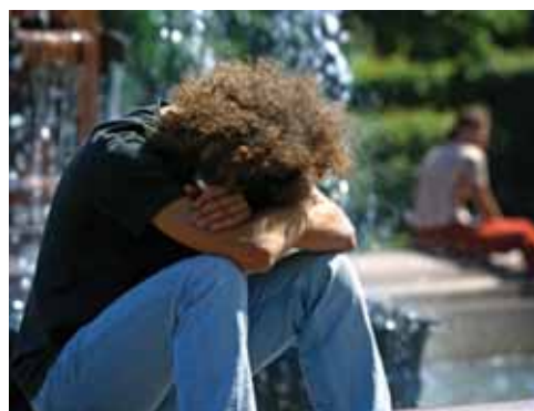
Mental health impacts relationships

'Low-income families, especially those who reside in poverty neighbourhoods, are daily exposed to a variety of experiences that place extraordinary stress on the couple and family relationships. In addition to the constant stress of making ends meet financially, and of working in unstable, low paying jobs, they have the frustrations of living in sub-standard housing in poorly serviced neighbourhoods, without adequate transportation, and they and their children are continually in fear of crime and violence. Members of their immediate or extended families may be struggling with depression, alcoholism or drug abuse, HIV/AIDS, or may be in and out of jail or some combination of those problems. Domestic violence is more prevalent in low-income households. Service providers who work with these couples note how often these accumulated stresses spill over into home, and anger and frustration too often poison their relationships between parents and children.' (Ooms 2002)