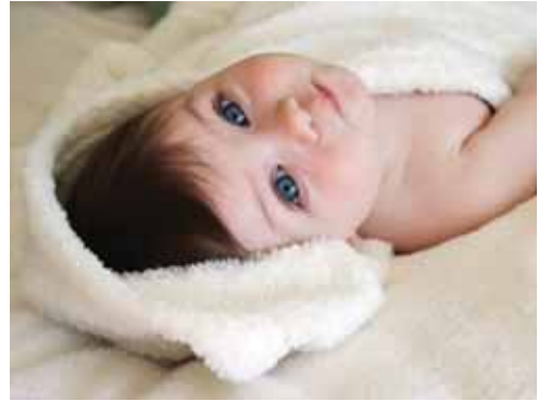
Ensuring every child is well cared for

wishing to learn from the results of the pilots, and not to pre-empt the findings, we would provisionally but strongly recommend that the Nurse-Family Partnership approach be adopted as a matter of priority throughout the country. This programme trains nurses to act effectively as a life coach for the parents, creating a high level of trust between nurse and family. Far from feeling 'nannied' or undermined in their role, mothers report a strong bond with their nurses, who provide them with a level of support which many have never experienced in their lives before.