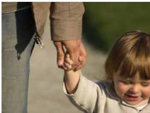
Childcare outside of nursery

Thirdly, and in relation to this last point, we want to look closely at how we better enable individuals, rather than the state, to raise their families and how to align services in a way that offers families genuine choice. We have, for example, become aware of the huge strain placed on relationships in families where there is disability. Not only does dealing with the disability produce tension but in large measure so too does fighting for care, education and other support services. If we are implicating the welfare state in the rise of family breakdown, we need to consider workable adjustments and indeed complements to it. The notion of the welfare society embraces a social responsibility agenda which begins to consider how to encourage people to make decisions based on the wider good of society, on deferred gratification rather than instant returns. It also draws in the wealth of talent and energy in this country's voluntary sector organisations.