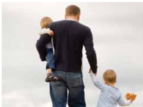
Fathers can have an active role to play in childcare choices

Increasingly, it is publicly acknowledged that there have been injustices for fathers who have not been able to have sufficient contact with their children for various reasons. Contact orders may well be made by the courts in favour of the parent without residence 82 but a breach of such order is not easy to remedy because draconian enforcement (such as imprisonment for contempt) can materially harm the children and their relationship with the absent parent.