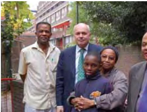
Political focus should take a holistic family view. Iain Duncan Smith meeting families on the Brixton Moorlands Estate

importantly, to back up those signals with necessary action cannot be said to be supportive of the family. We therefore recommend the following: