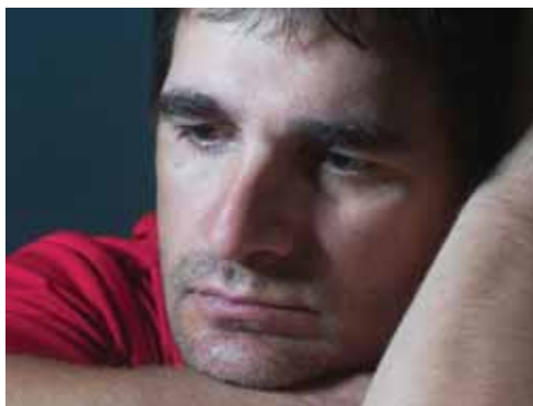
Some fathers have experienced injustice under current laws.

We propose the compilation of a new statistical index of family and social cohesion. The Government’s social exclusion unit lists eight reasons for social exclusion – unemployment, discrimination, poor skills, low incomes, poor housing, high crime, ill health and family breakdown. All of these reasons, with the exception of family breakdown, are well-represented in the indices of social exclusion compiled and published by the Office of National Statistics. These indices can be used to highlight status and progress of social exclusion within any individual local authority or ward.