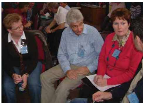
Debt Advice Training Session

There are a number of different services available to help people who find themselves in unmanageable debt, a number of which offer an excellent standard of practical help and support. However, given the diversity of the market and the demand for these services, more needs to be done. Among other things the Government needs to ensure better regulation, sufficient availability of the right services for the individual debtor, and fairer funding for debt agencies, and in particular for smaller community based services.