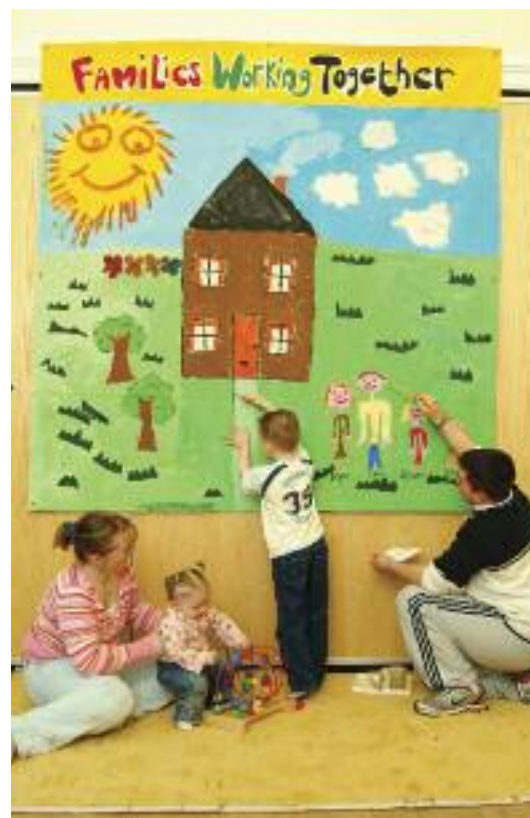
Quarriers Family Resource Centre is working to keep families together in areas of significant disadvantage in Glasgow

Hence a person's life chances are often predicated on their experiences in childhood. A child's ability to engage at school is in part determined by their home life, and their subsequent (un)employment likewise.