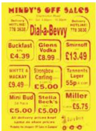
Dial-a-Bevvy: alcohol consumption is destroying Glasgow’s most hard-pressed communities. Alcoholic liver disease is Glasgow’s biggest cause of ‘pre-mature death.’

We therefore recommend an expansion of third sector abstinence based provision, such as that provided by the Maxie Richards Foundation. Charities with proven track records in enabling addicts to become drug free focus on the individual as a whole and hence tackle the causes not just the symptoms of addiction.