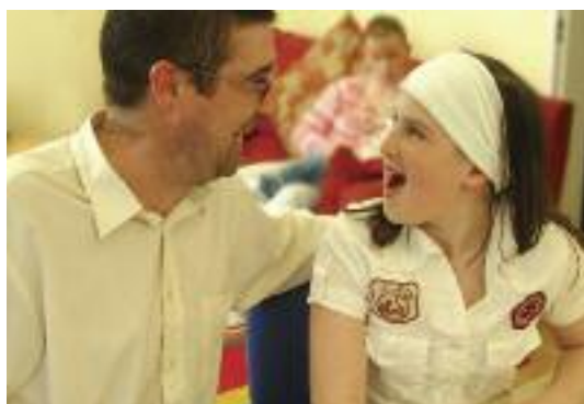
Through the provision of non-stigmatising and multi-disciplinary support, Quarriers Family Resource Centre is keeping families together in Glasgow. The charity is having a huge impact on the community it serves.

Family breakdown reflects and perpetuates the levels of deprivation and worklessness – with its associated outcomes such as crime and addiction – that