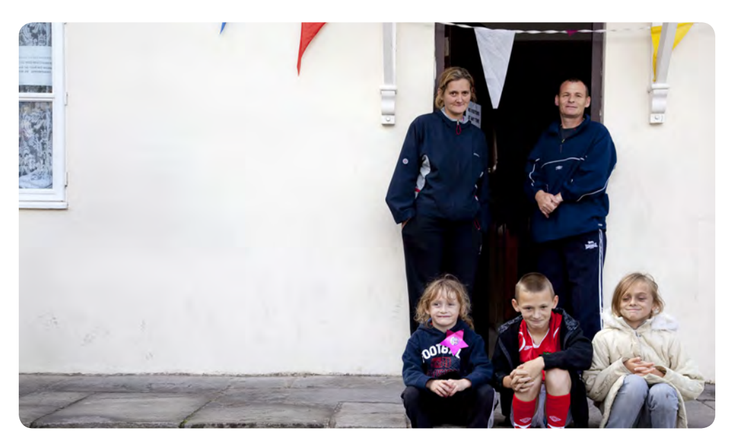
Save the Family (described later in this chapter) work with the whole family and help couples to strengthen their relationship as well as to improve their parenting skills.

The Parents as Partners programme described earlier in this report (see p73) is an example of the kind of intervention that recognises the importance of the couple relationship to children's outcomes and helps parents to make significant and lasting improvements across a range of measures.